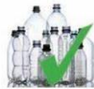
Plastic bottles and containers 1-6