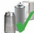
Steel and aluminium cans