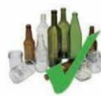
Glass bottles (lids removed)

The Kinsmen met with recyclers and set up a program where people could drop off recycling items (refundable beverage containers and metals) and donate the proceeds to the Tabs program right at the recycler's place of business. The funds would be forwarded to the Kinsmen to use for the project.